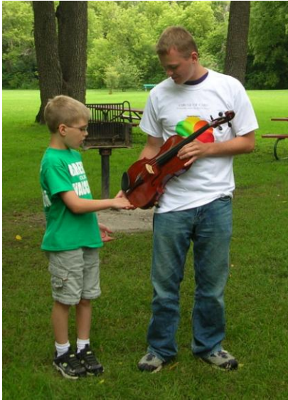
Summer concert in the park and family and friends picnic.